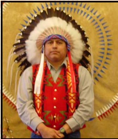
Four Bears Segment Representative

404 Frontage Road Administrative Building, Four Bears, ND 58763