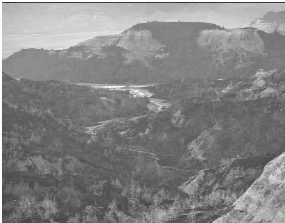
This wild fire was horrendous this wild fire burned about 8,000 acres of land by route 17 and had grown to 9,800 acres. This was one of the most massive wild fires that ever covered the lands on the Fort Berthold Reservation. This was called the Little Swallow Fire.