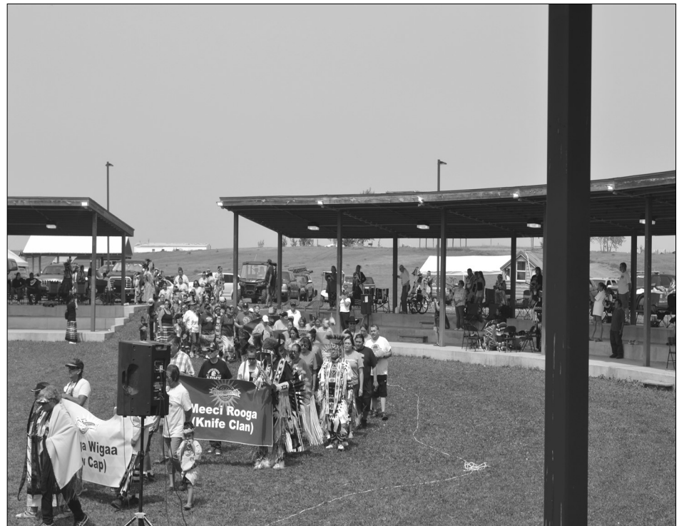
The Meece Rooga Knife Clan members carrying the blue banner and wearing blue t-shirts.