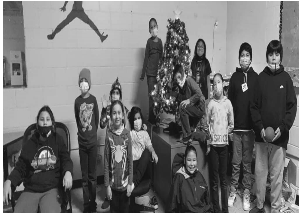
Mandaree Boys & Girls Club take time out to decorate their tree at their club.