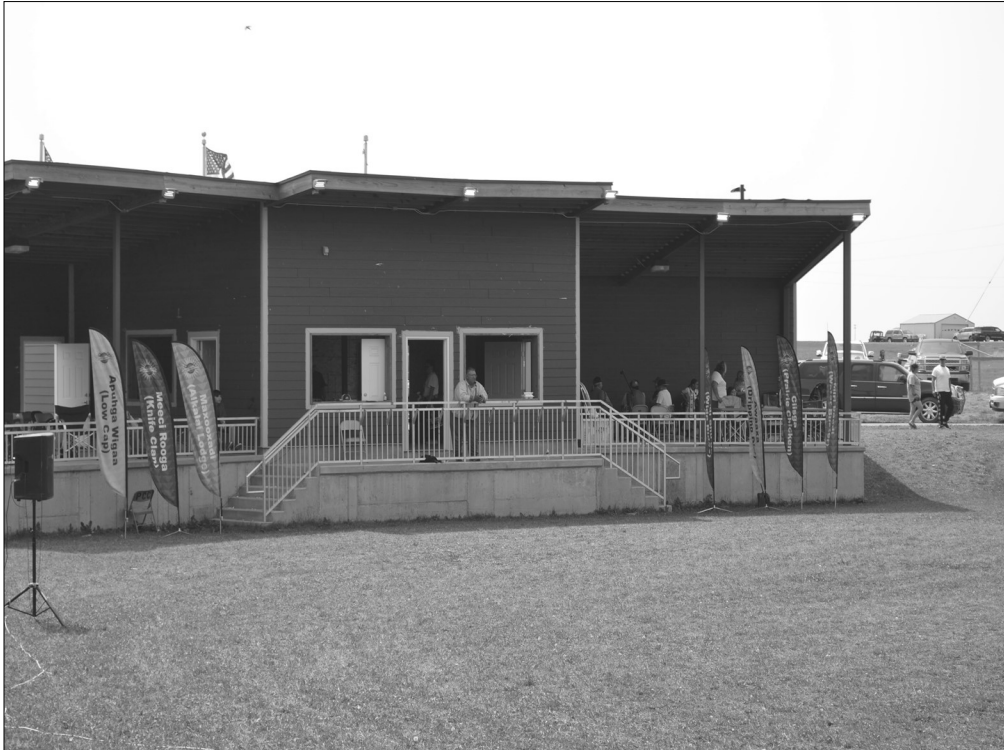
Pictured above are colored flags with our Clans on them. Each flag was carried in by a clan member and tee shirts were given to all clan members. Low Cap-Yellow, Knife Clan-Blue, Alkalia Lodge-Turquoise, Dripping Dirt-Lime green, Water Buster- green, Prairie Chicken-Purple, Wide Ridge-Red.