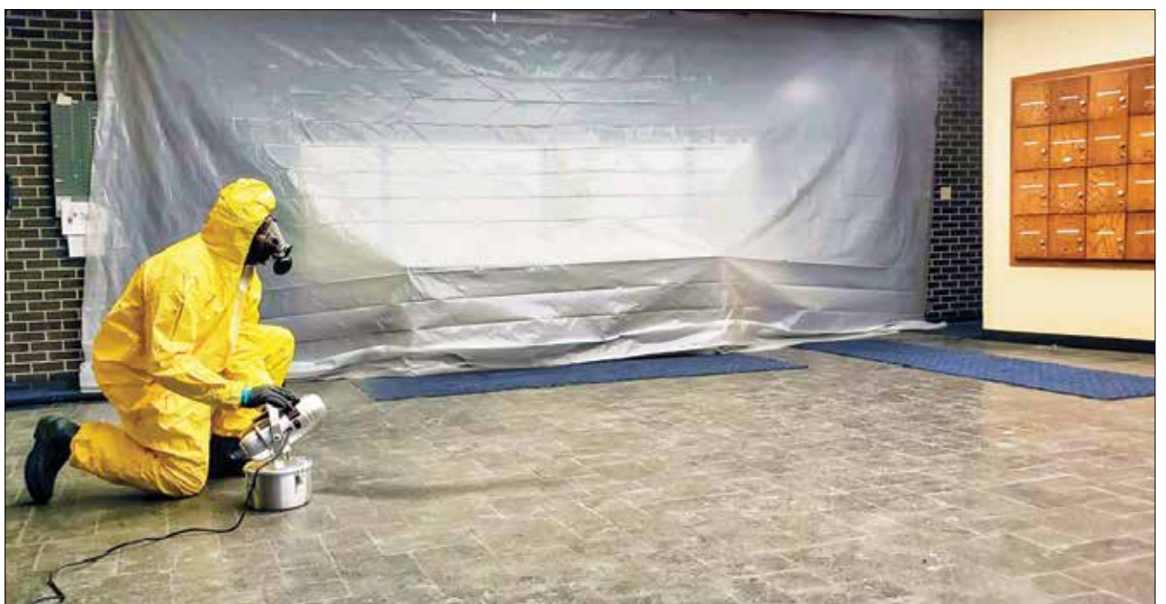
Sanitizing tribal offices.

Not all active essential workers are on-site. Many are working remotely, and departmental managers determine their workload and capacity. Those working from home