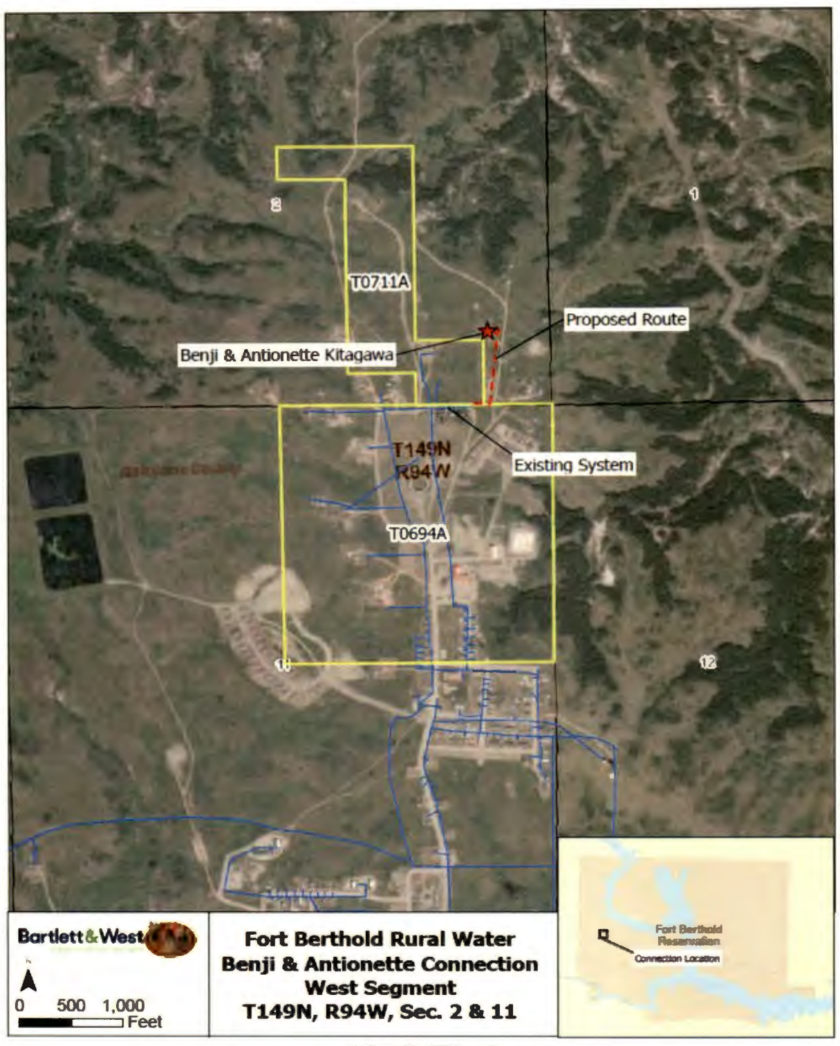
APPENDIX A. 5