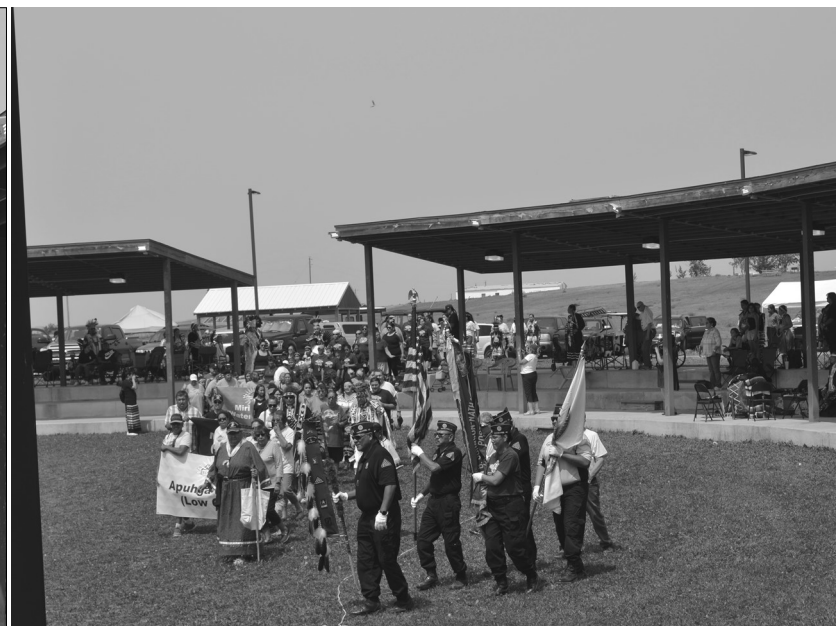
Leading the Clans were the Apuhgah Wigaa Low Cap carrying their flag with Clan members. Clan members wore yellow t-shirts.