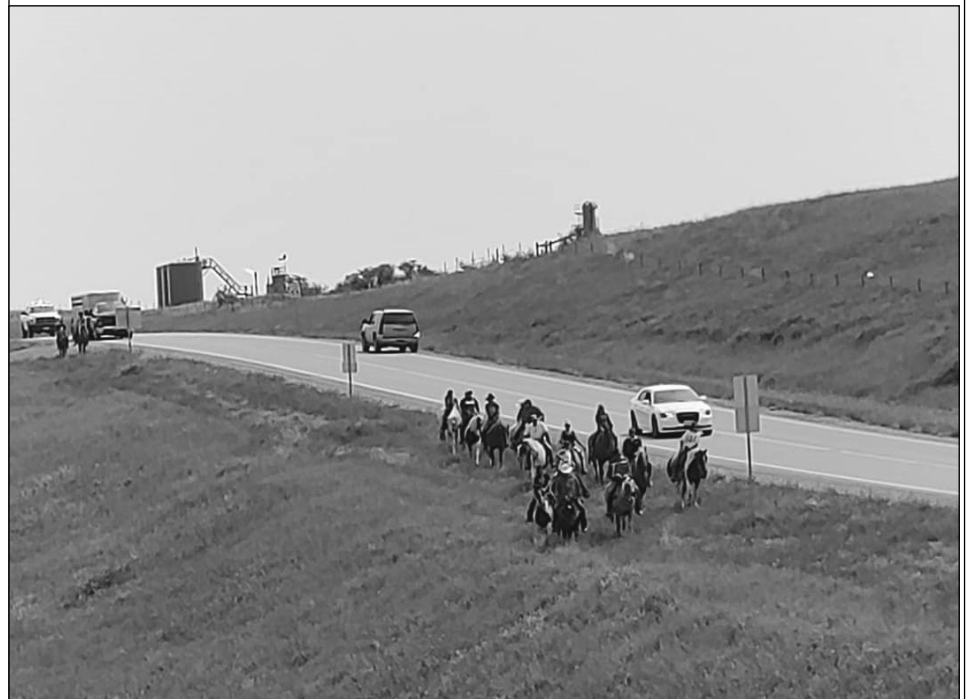
drugs and alcohol. In the picture above you can see some of the riders as they ride into Mandaree to the celebration grounds.

We also did a Memorial ride for those lost to Covid-19,