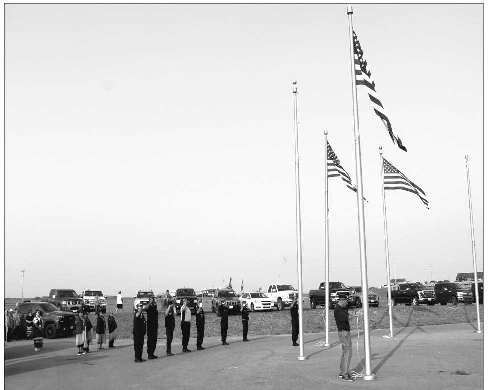
Flag raising at the 2021 Mandaree Gathering Celebration at the celebration grounds here in Mandaree.

I would like to commend the Myron Johnson/Nathan Good Iron Post 271 for their commitment and dedication for the early morning hours of flag raising. The Posts throughout our reservation are always there right along with the families of the flags being raised.