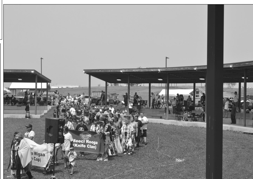
The Meeci Rooga Knife Clan members carrying the blue banner and wearing blue t-shirts.