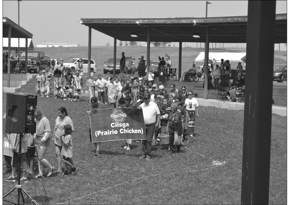
The next clan carrying in their banner was the Ciisga Prairie Chicken Clan members wearing their purple t-shirts.