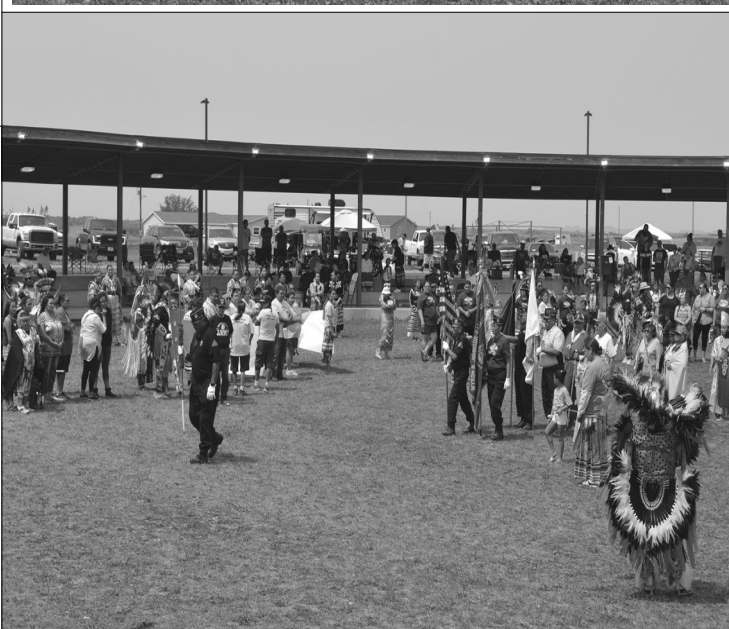
In the photo to your left are the color guard being introduced to everyone. Before the celebration started. In the upper photo Clans dancing in grand entry.