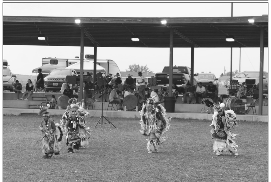
Little boys dancing during the Mandaree Celebration Gathering.