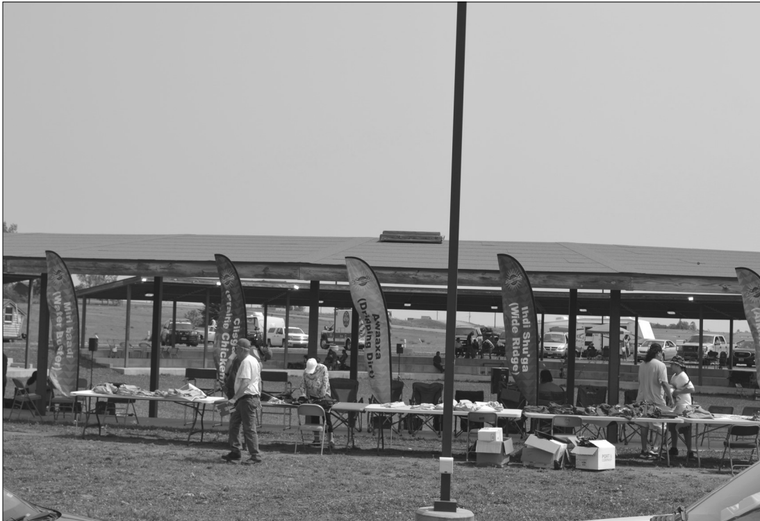
Banners with names of our Clans were set up and tables were placed in front of each banner with Clan t-shirts. So Clan members can help themselves to their Clan t-shirts. They had different colors for each of our seven Clans each t-shirt had their Clan names in Hidatsa.