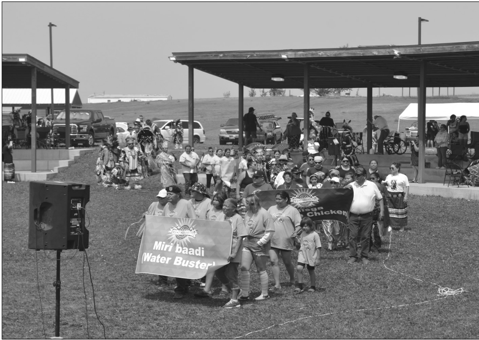
Entering the grand entry are members of the Miri baadi Water Buster Clan carrying their banner and wearing green t-shirts.