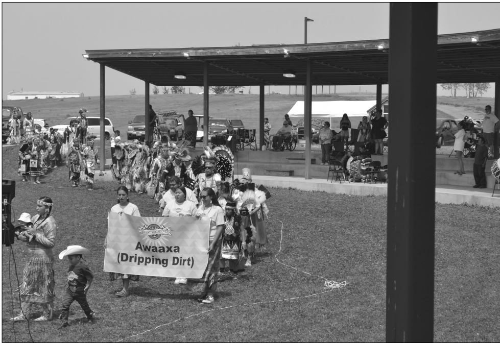
The Awaaxa Dripping Dirt Clan members carry their banner. With their lime green t-shirts.