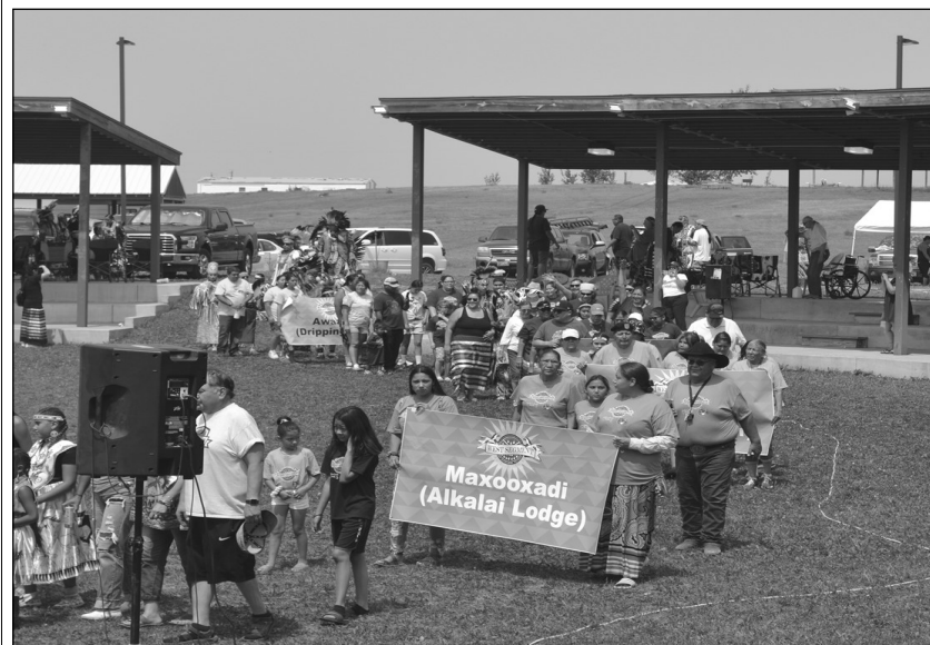
Maxooxadi Alkalai Lodge members carrying in their banner and wearing their turquoise t-shirts.