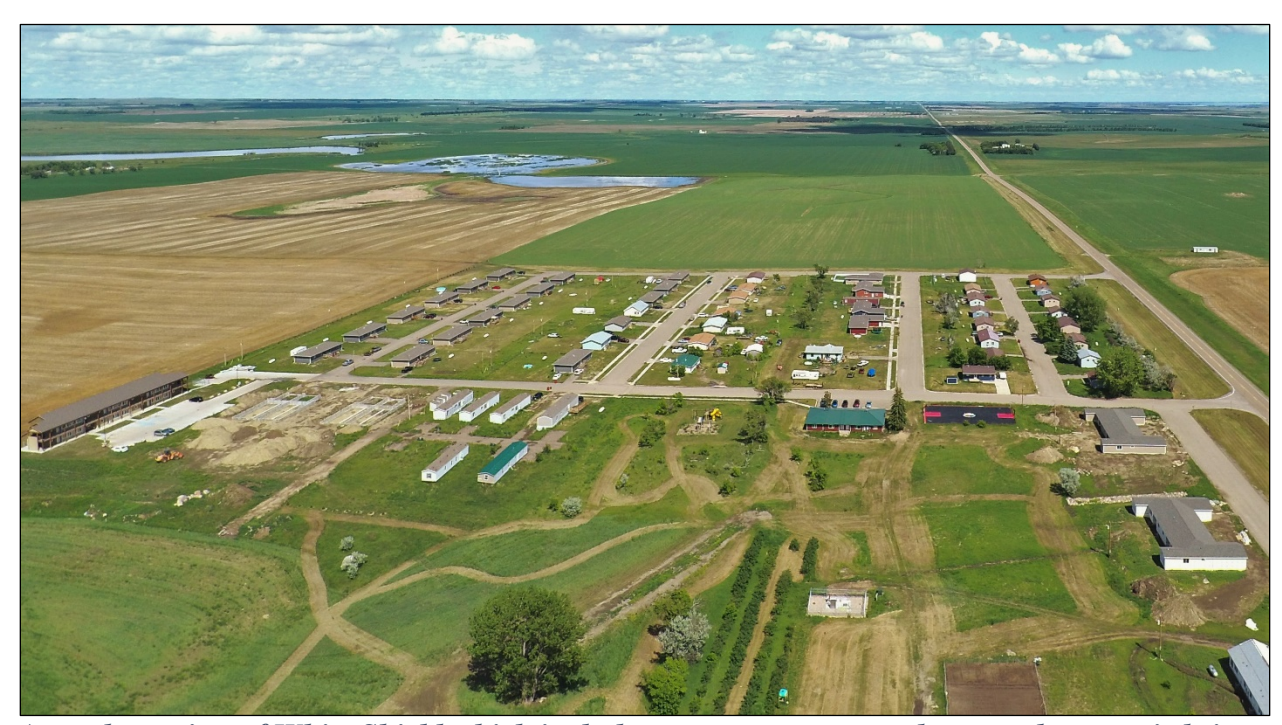
A southern view of White Shield which includes new apartments and soon to be occupied six new duplexes from a drone.