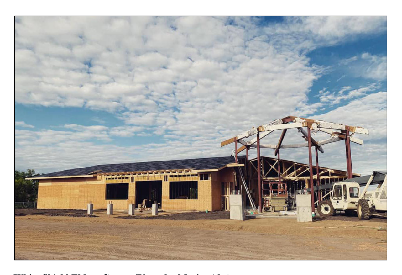
White Shield Elders Center

Picture above is of progress on the White Shield Elder Center. Roof for the lobby entrance is being installed.