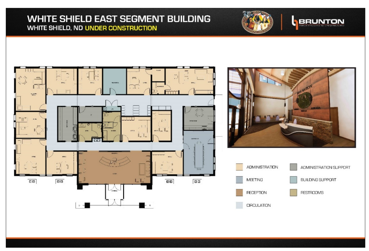
The above Master Plan is a good look at what will be in new Elders' Center and where rooms will be located in building.