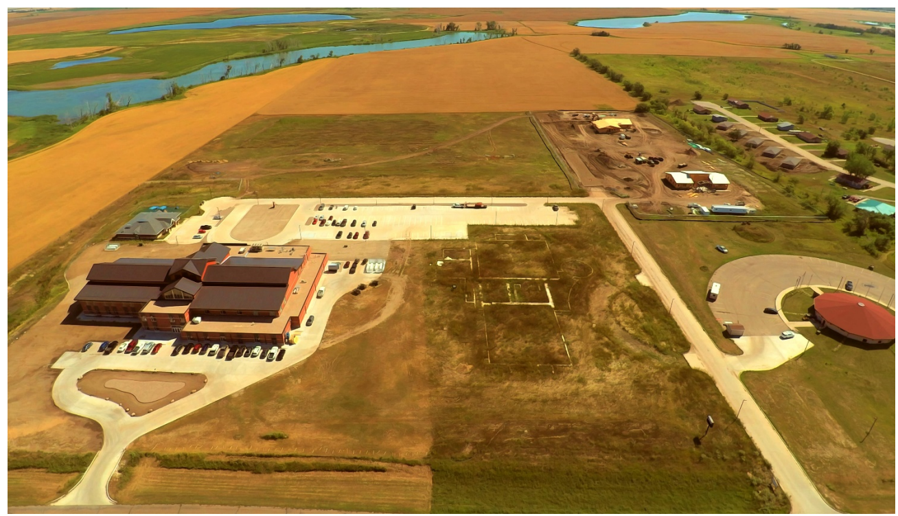
View of Elder's new Building, New Ralph Wells Community Building, the Public Safety Building which will hold the Fire Department, Ambulance, Law Enforcement, and a holding cell. Two buildings to be completed in early December.