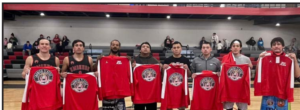
Men's 2 nd Place: "Omaha Racers"