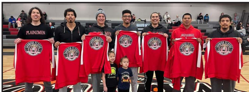
Men's 3 rd Place: "Plainzmen"