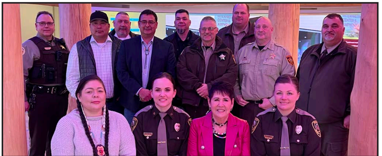
March 14 th : MHA Tribal Business Council host working session with local County Sheriff's Departments

I do have to mention one of the most exciting moments this month was the White Shield boys basketball District and Regional Basketball tournament. The boys finished the tournament season strong and almost knocked of the #3 team in the State of North Dakota Powers Lake. The