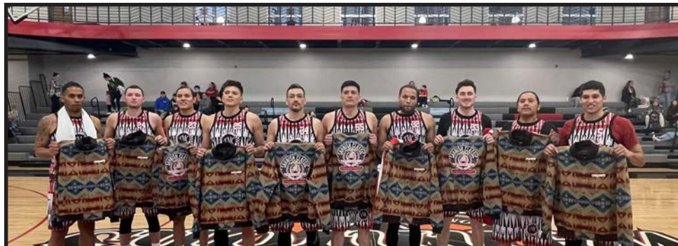
Men's 1 st Place: "Stray Nation"