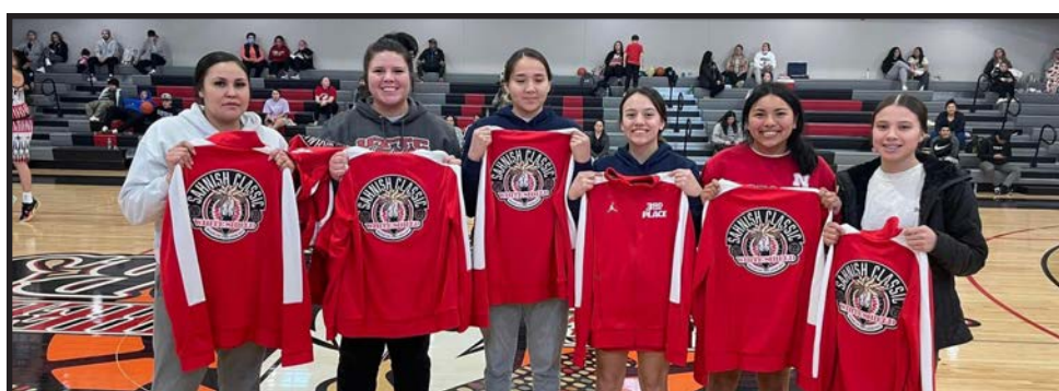
Women's 3 rd Place: "Da Aunties"