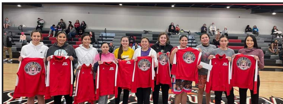
Women's 2 nd Place: "Burning Feathers"