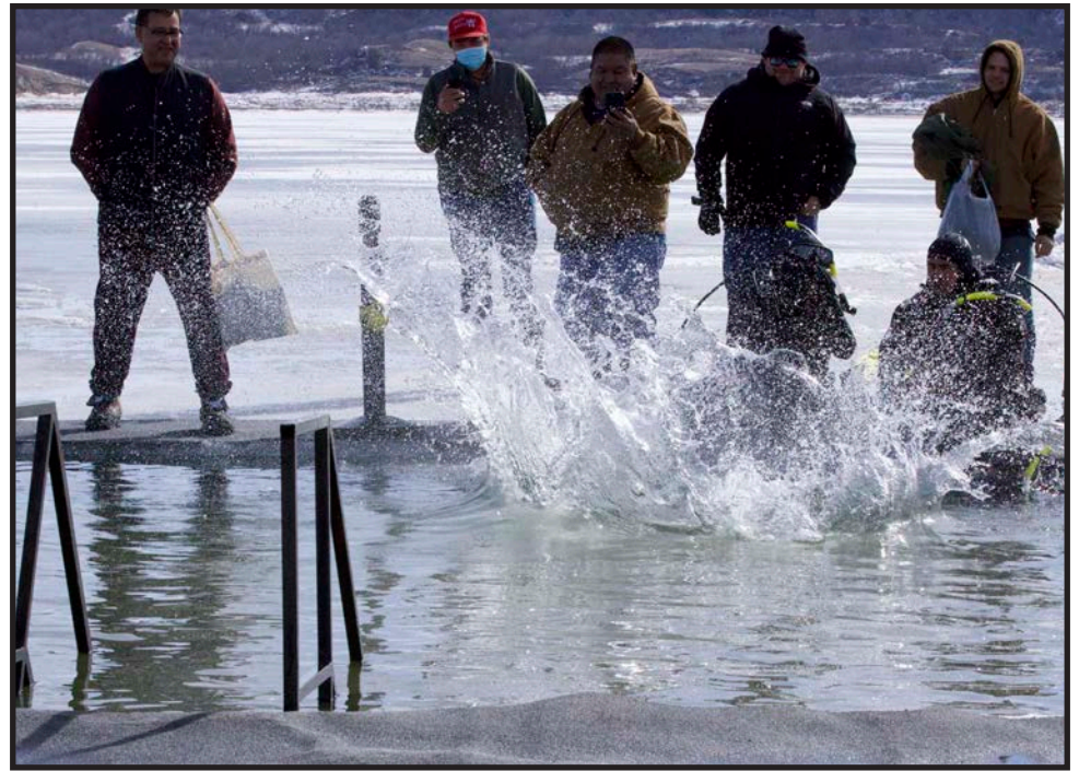
Polar Plunge

Fox said he was confident they raised more than their goal of $50,000.