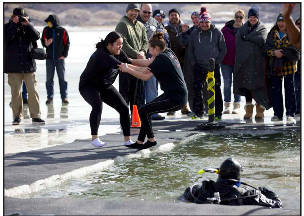
Polar Plunge