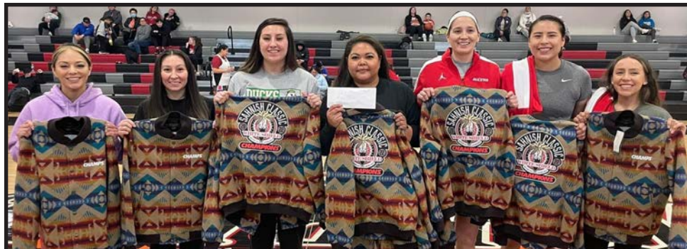
Women's 1 st Place: "X-Factor"