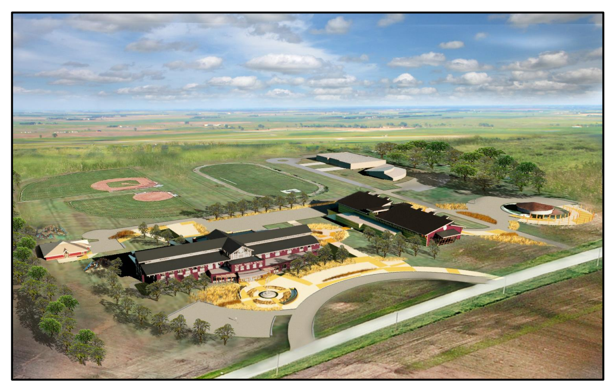
Ariel view of the new school, community building and headstart as they sit next to the Culture Center.

The White Shield school was also built in 1953 and needs to be replaced. It will be built with oversight of the BIA, but will be funded by the tribe. The BIA will be responsible for operation. It will also set in an area near the Culture Center and near the Community Center where some of the school activities can happen at the Center.