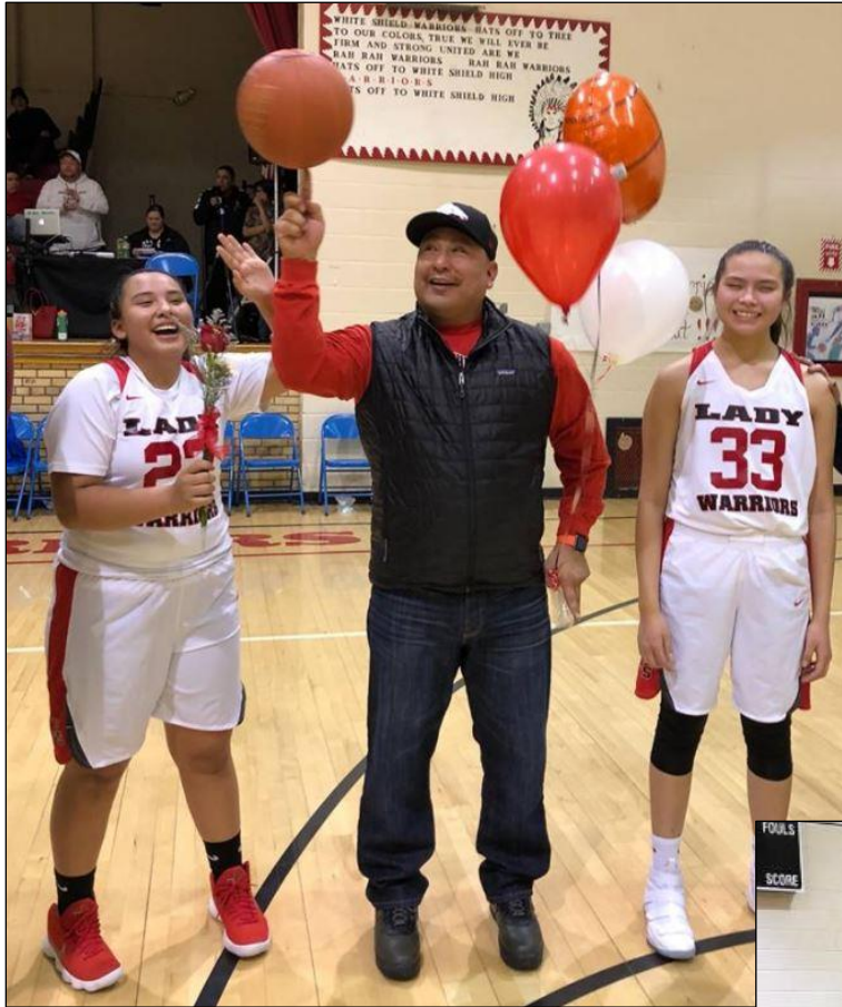
Fox spins ball like Globe Trotters