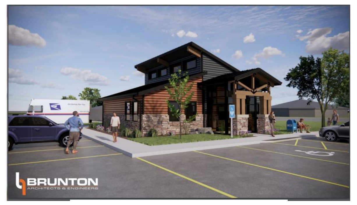
Architect's drawings of proposed post office in White Shield.