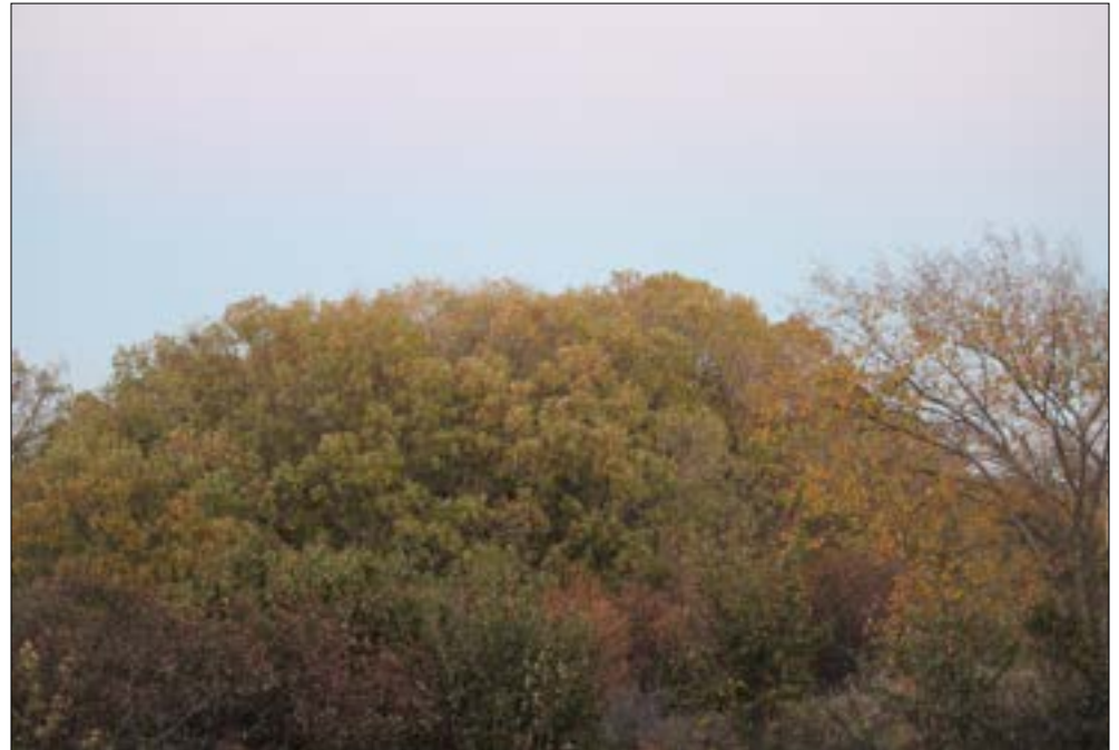
Amazing how mother nature changes the colors on trees I took this picture in my back yard. The tree was shaped like a cone.