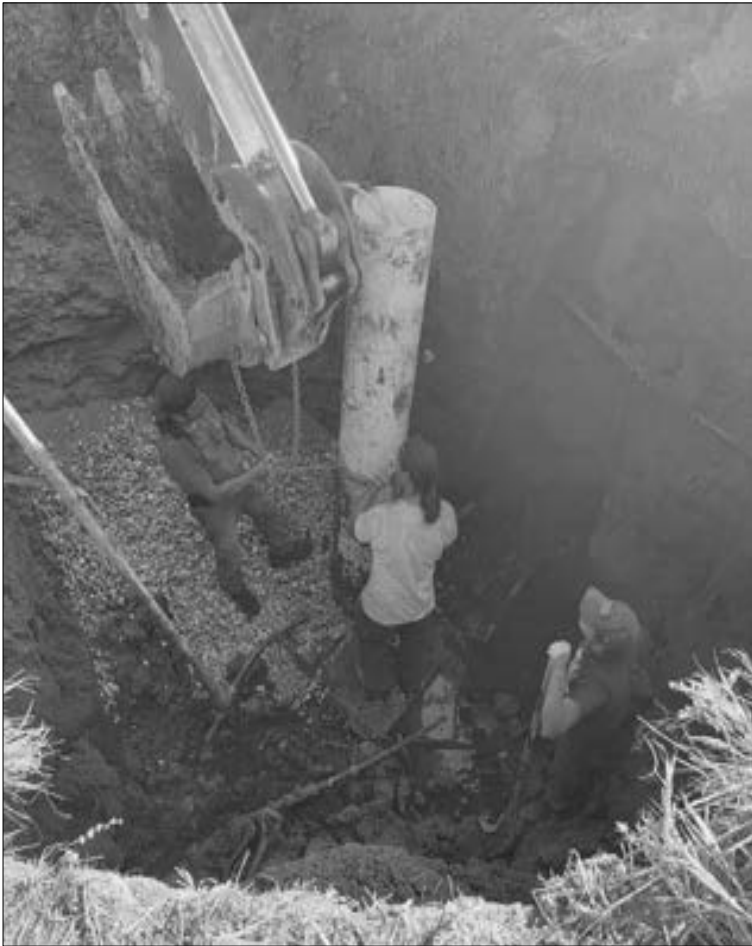
Here you can see the workers putting the chain around the pipe so it can be lifted.