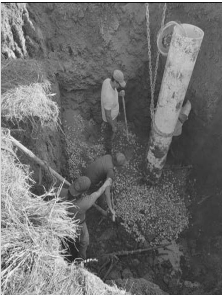
The chain is around the pole and ready to be lifted.